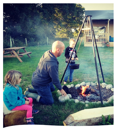
BBQs at Jurassic Glamping, East Devon