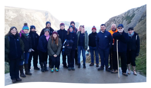
Durdle Door Holiday Park staff on a JCT training session